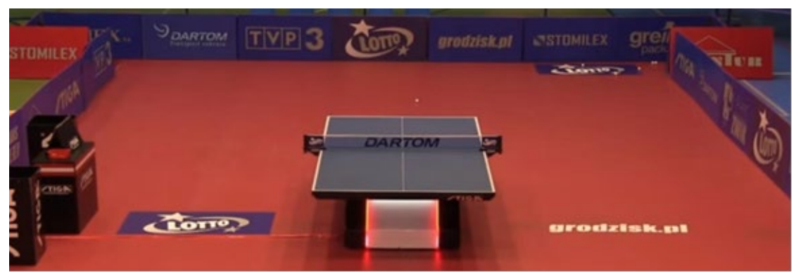
Example show court with BBGs zones

Playing field with designated zones for BBGs.